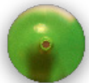
Catheter Tip Opening