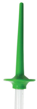
Catheter Tip Length

TMI1162-HF ..... eZInject SIS Catheter with High-Flow