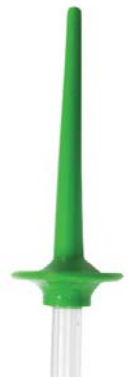
Catheter Tip Length

TMI1162-HF . . . . . eZInject SIS Catheter with High-Flow