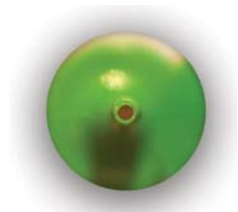
Catheter Tip Opening